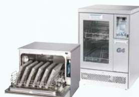
SciCan HYDRIM (with rail)