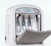
SciCan STATMATIC smart