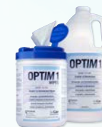
SciCan OPTIM 1