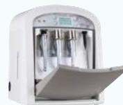
SciCan STATMATIC smart