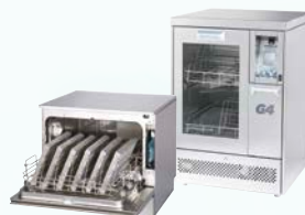
SciCan HYDRIM (with rail/LCS system)