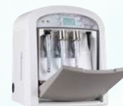
SciCan STATMATIC smart

Pre-cleaning e. g. by using an Ultrasonic device